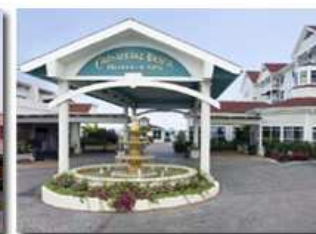
We organize useful networking events at member restaurants and businesses.