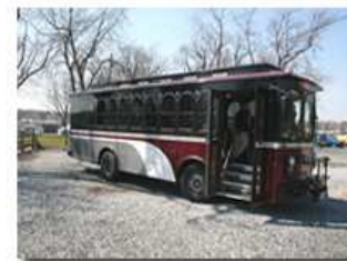
BBG members founded the Beach Trolley to transport customers to your business.