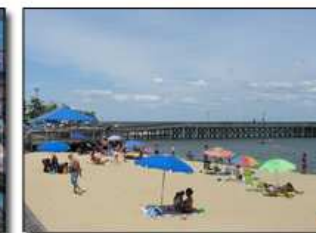
The BBG sponsors numerous special events in the area which draw new customers.