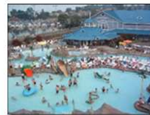
The BBG supports and encourages tourism, which benefits all businesses.