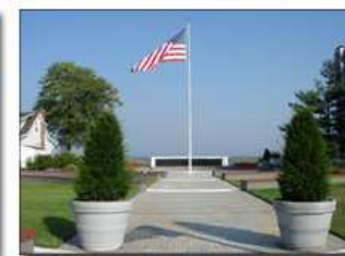
The BBG works with government officials to represent your business interests.