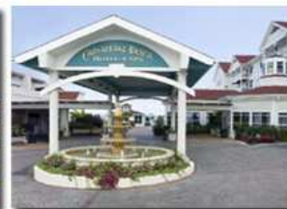
We organize useful networking events at member restaurants and businesses.