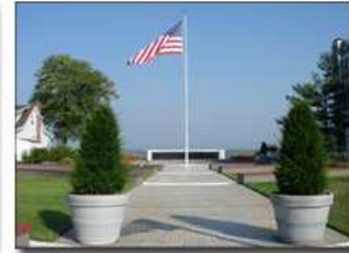
The BBG works with government officials to represent your business interests.