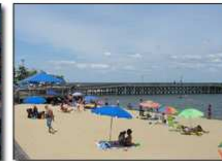
The BBG sponsors numerous special events in the area which draw new customers.