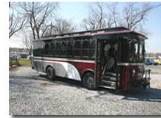
BBG members founded the Beach Trolley to transport customers to your business.