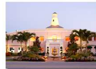
Meetings are held at nearby locations on the third Wednesday of each month.