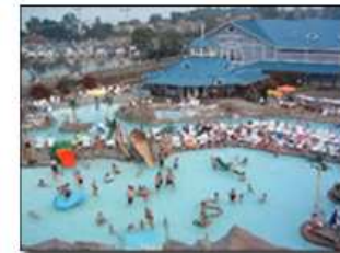
The BBG supports and encourages tourism, which benefits all businesses.